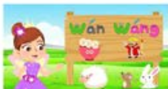
CL Digital Resource: Hanyu Pinyin Animation