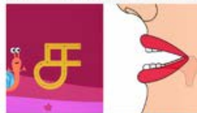
TL Digital Resource: Tongue Placement Videos