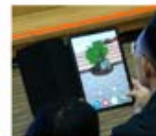
TL Digital Resource: AR Experience