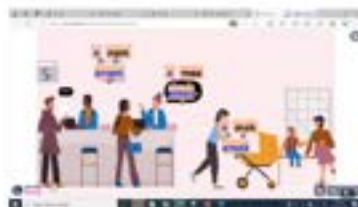
ML Digital Resource: Bridging Videos